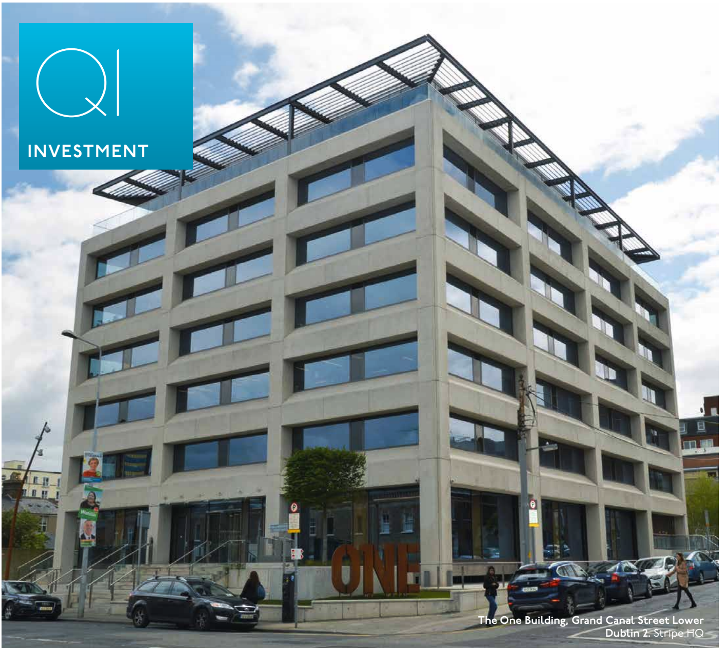
The One Building, Grand Canal Street Lower Dublin 2. Stripe HQ

“ Notable increase in off-market activity”