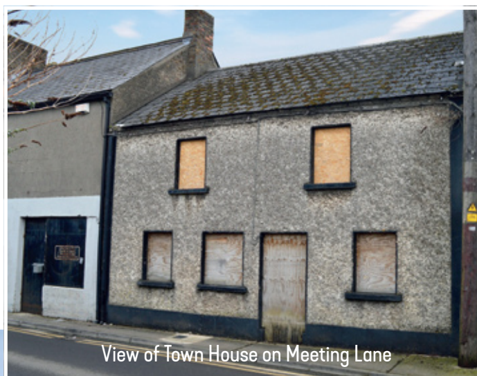
View of Town House on Meeting Lane