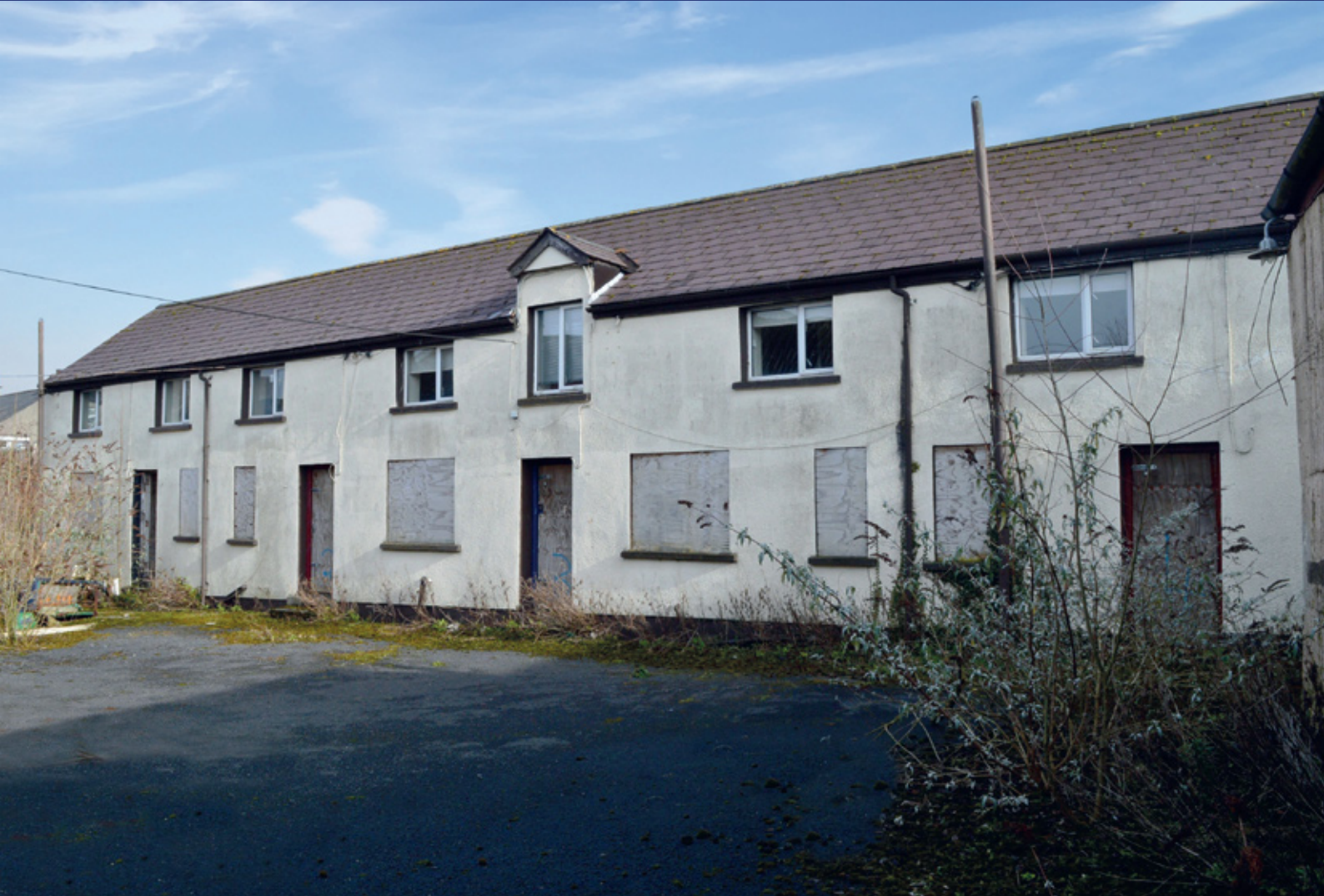
View of 4 No. Town Houses