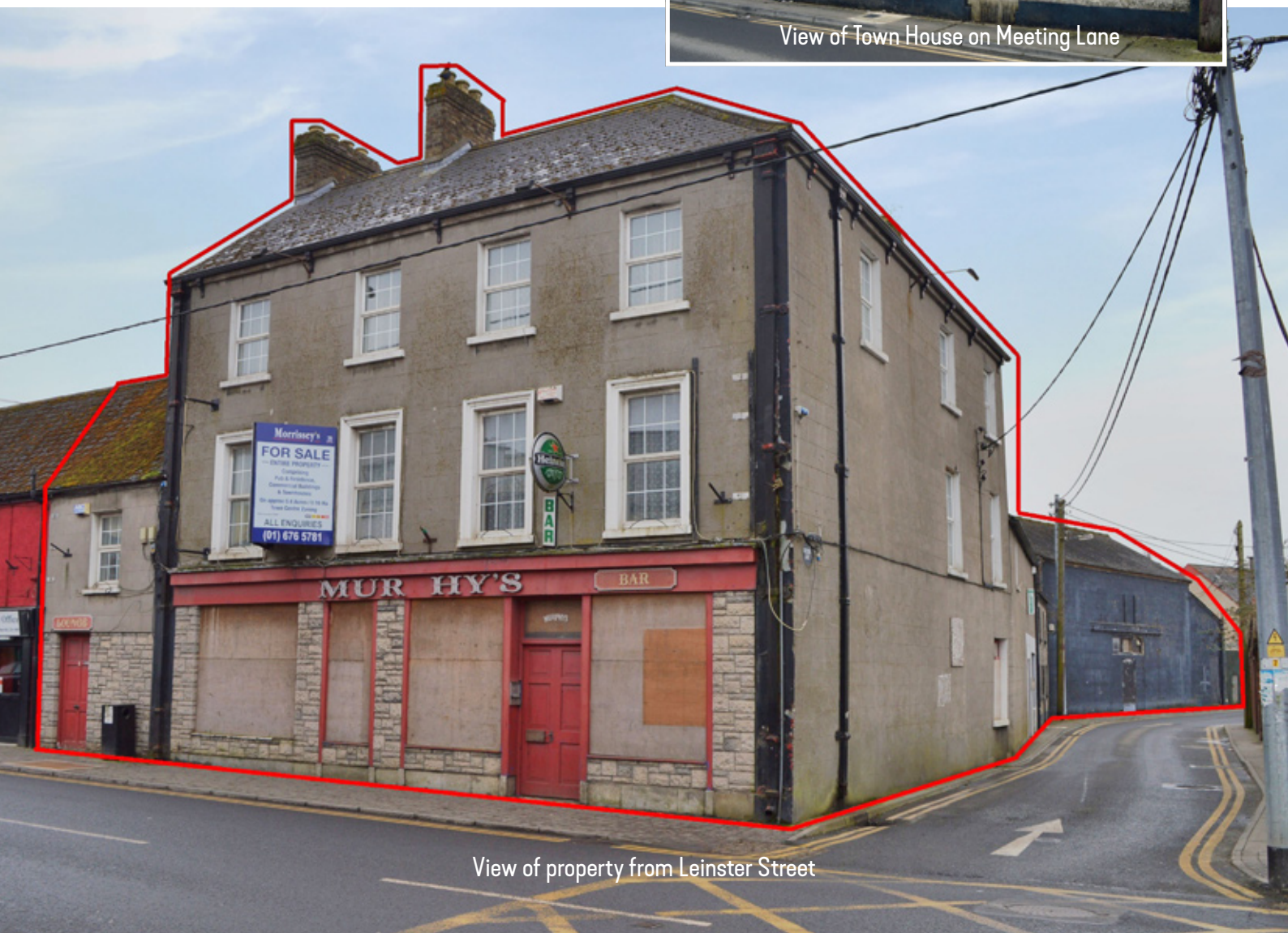
View of property from Leinster Street