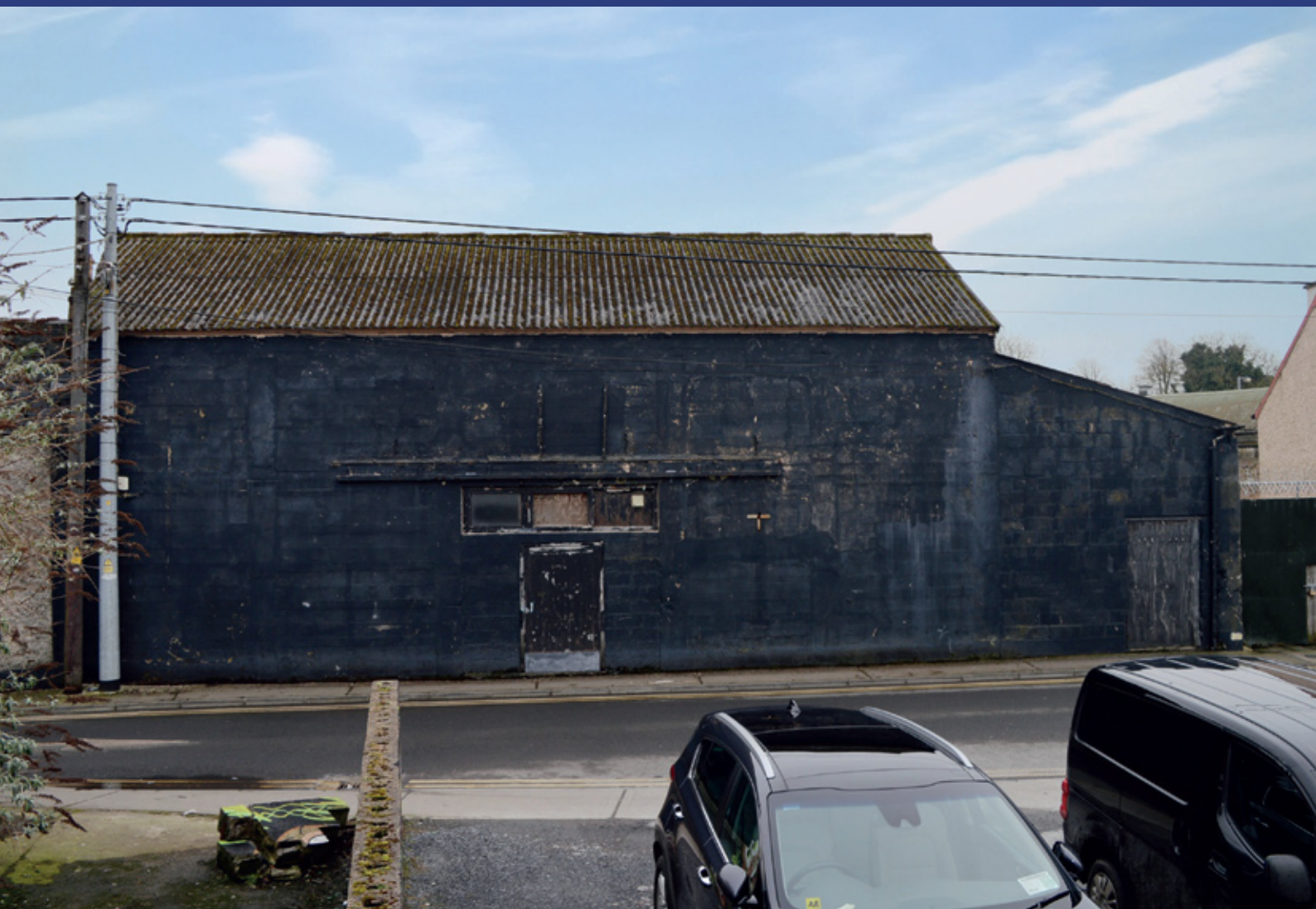
View of Ballroom on Meeting Lane