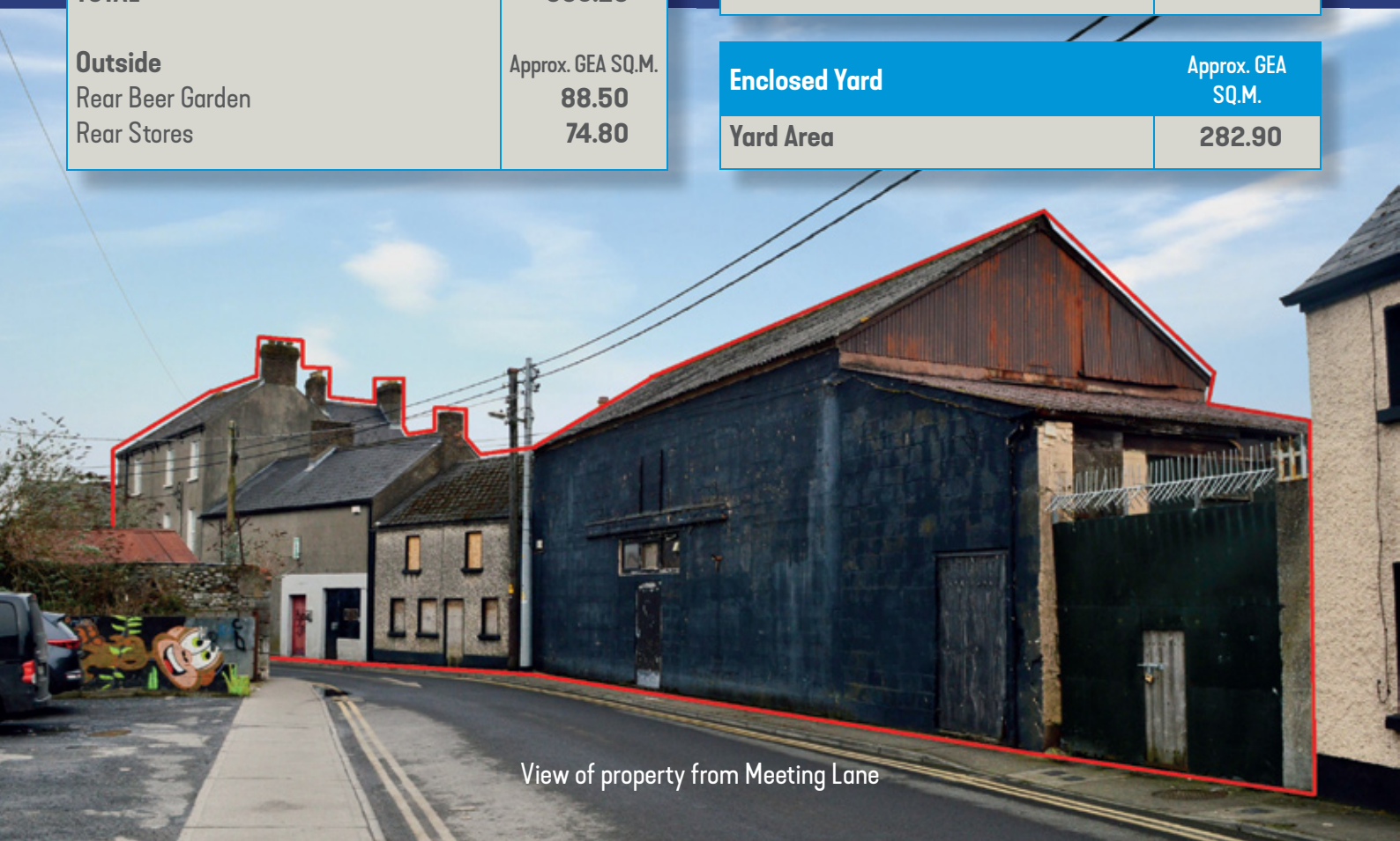
View of property from Meeting Lane