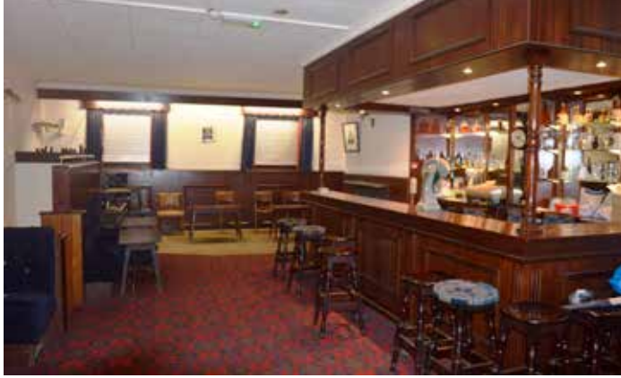
First Floor Lounge