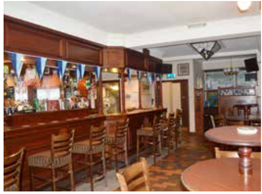
Ground floor bar