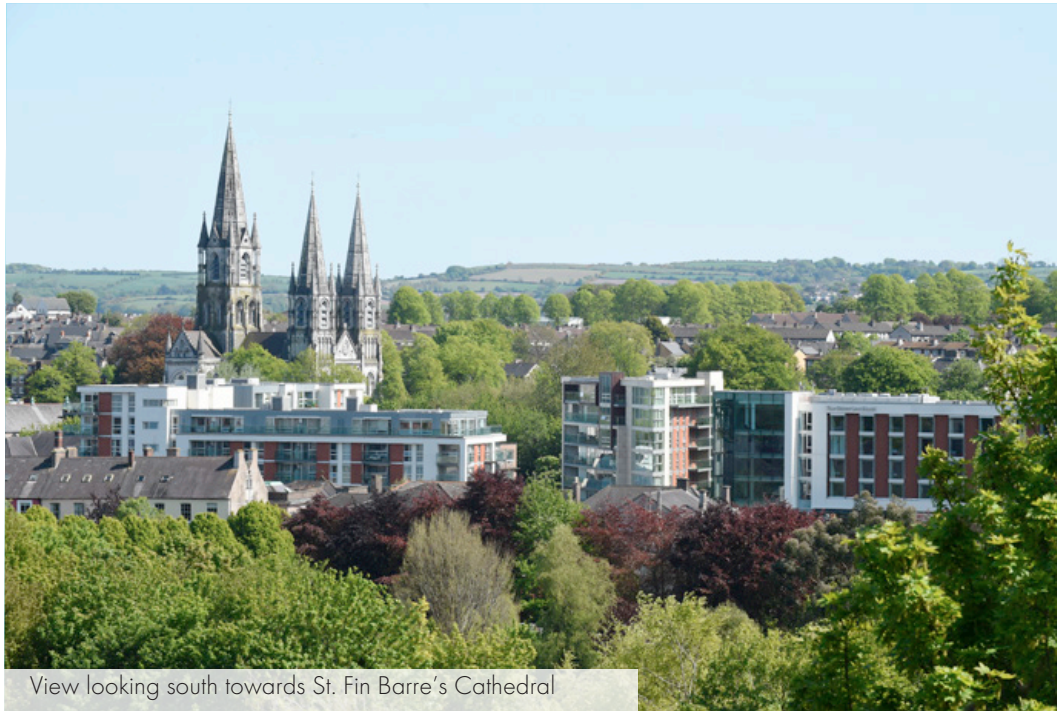
View looking south towards St. Fin Barre's Cathedral

The property is situated to the north of Cork city centre approx. 1km north west of Patrick Street, the city's main retail and commercial thoroughfare. It is situated on the southern side of Sundays Well road as its eastern end in an elevated position overlooking the UCC North Mall Campus, the River Lee, the Mardyke and the city. The property is within walking distance of the city centre, University College Cork and Cork Mercy University Hospital. Sundays Well is an old established residential location in Cork.