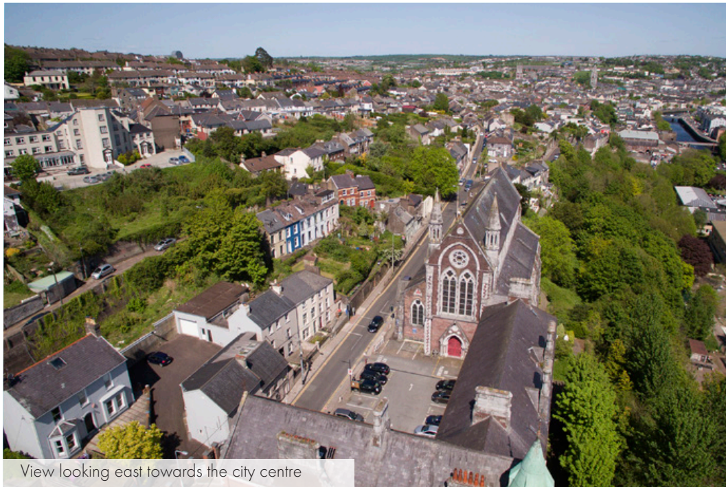
View looking east towards the city centre