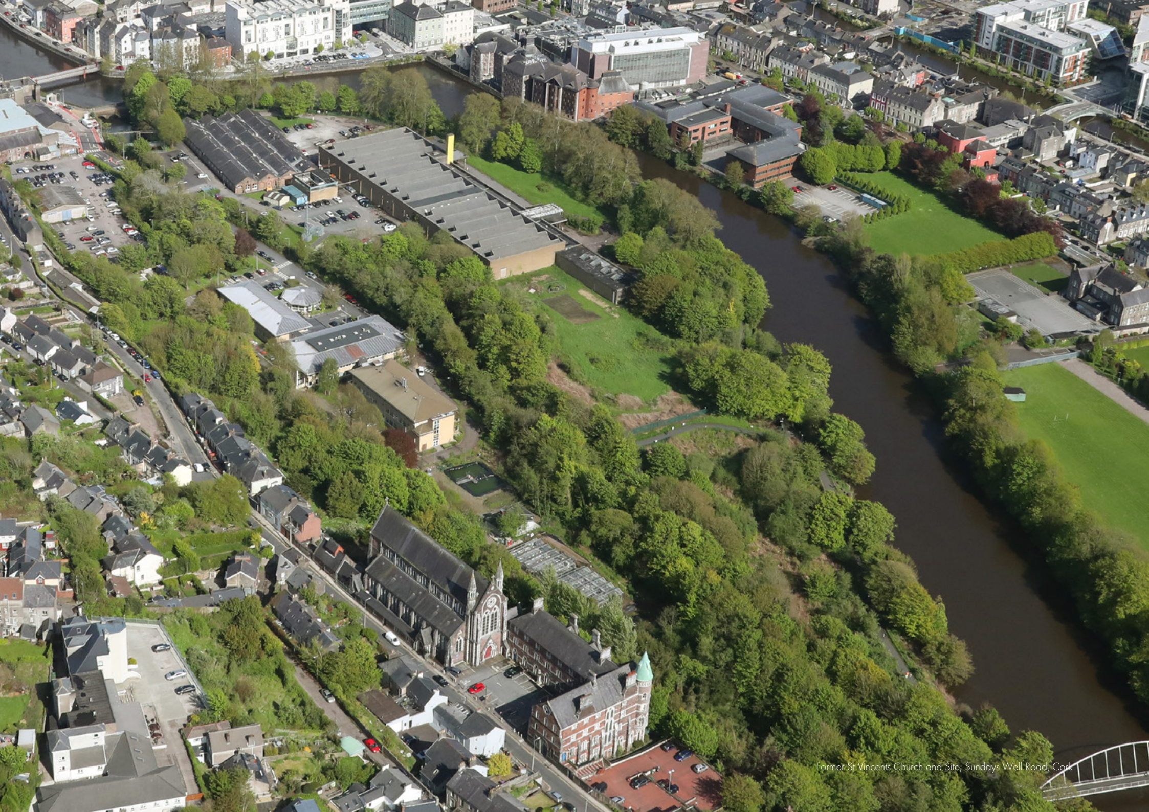
Former St Vincents Church and Site, Sundays Well Road, Cork