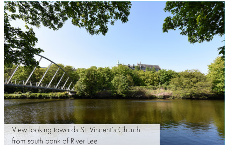
View looking towards St. Vincent's Church from south bank of River Lee