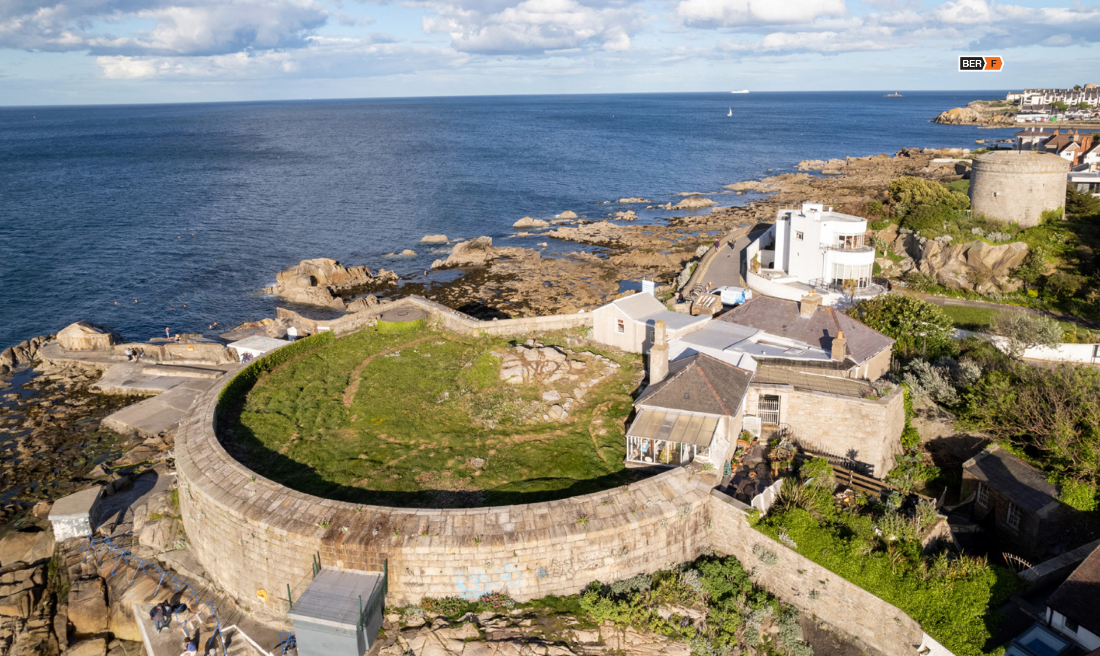
The Battery, Sandy Cove Point Sandy Cove, Co. Dublin