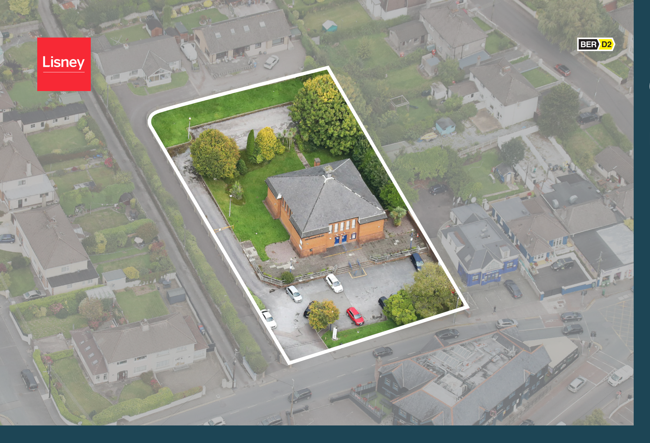
1 Curraheen Road, Bishopstown, Cork | T12 RK60