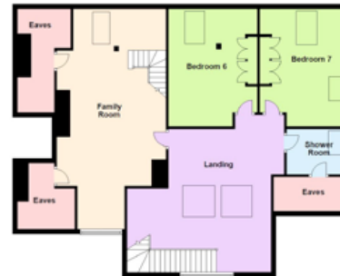
Family Room Mezzanine