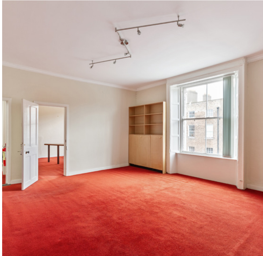
The property comprises a four storey over basement former townhouse with mews building / site to the rear.