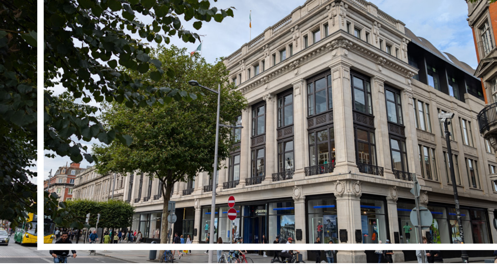
ABOVE: Henry Street, Dublin 2