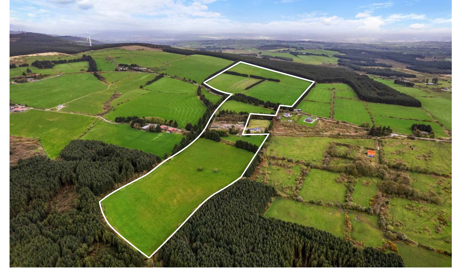
Good quality agricultural land laid out in grass.