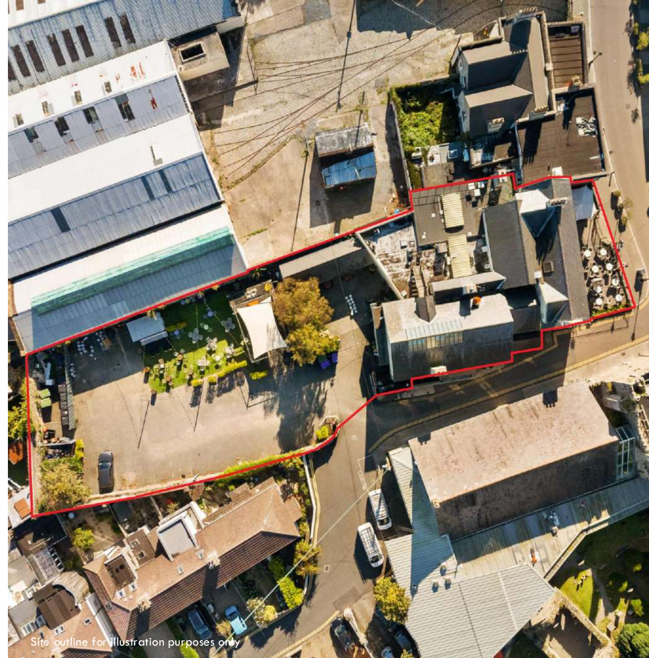
Site outline for illustration purposes only