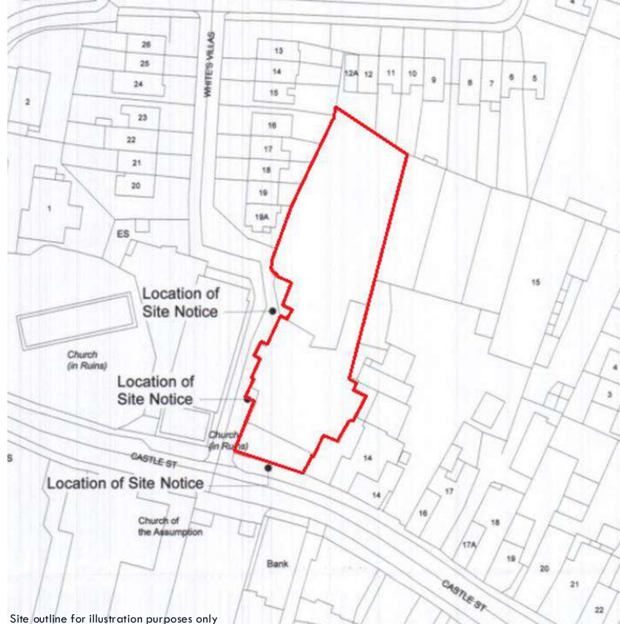
Site outline for illustration purposes only